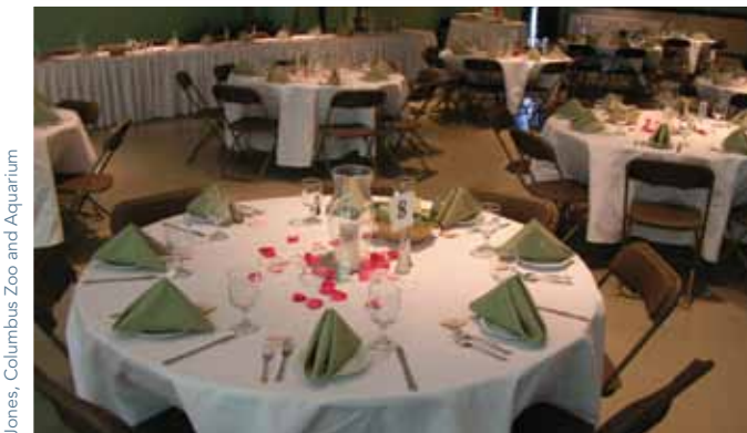
Indoor Activity Pavilion