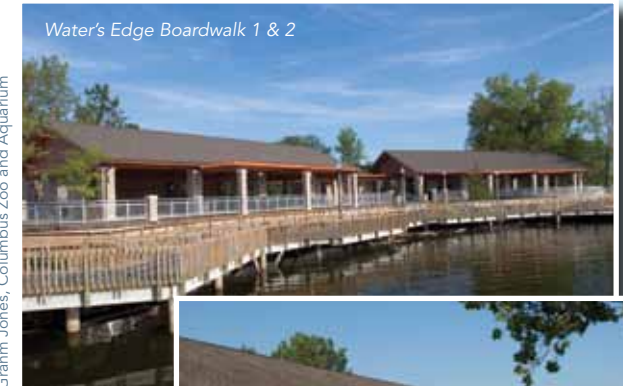
Water's Edge Boardwalk 1 & 2